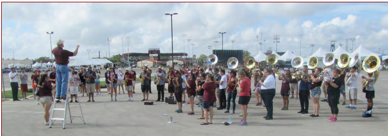
Alumni Band 2015

Let's make it the biggest yet! (Hey, it won't be 100 degrees!)