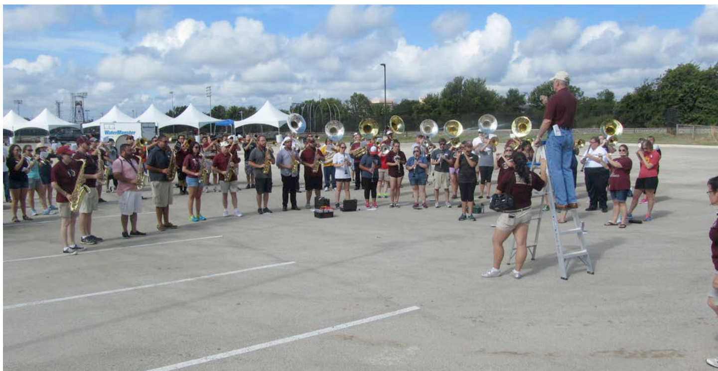
Alumni Band Rehearsal, September 19, 2015