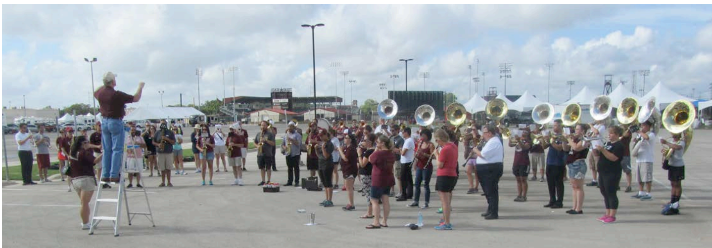
Alumni Band Rehearsal, September 19, 2015